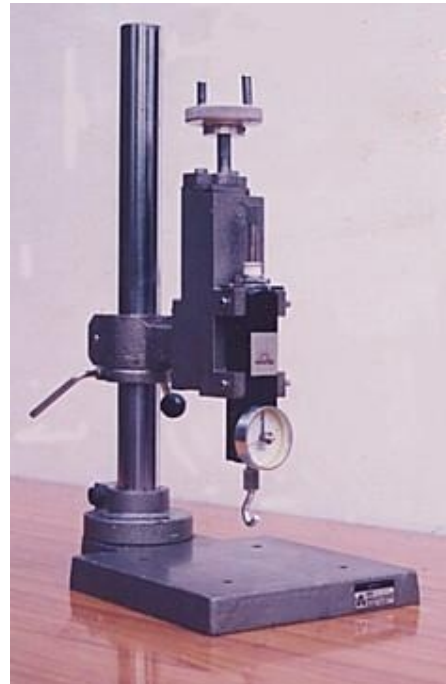
Accessories : Stand with Holder - Slide.

Warranty of one year (invalid if tampered with).