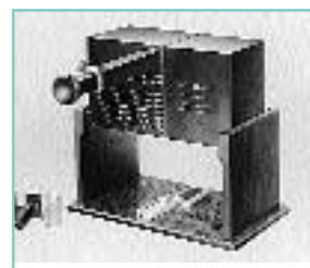
Lovibond® Tintometer circa 1930