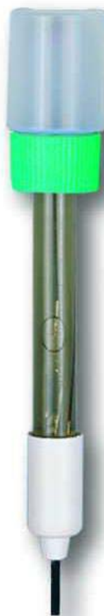
pH electroode ( optional )