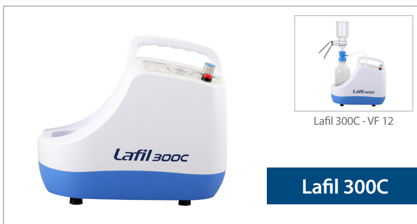
Lafil 300C - VF 12