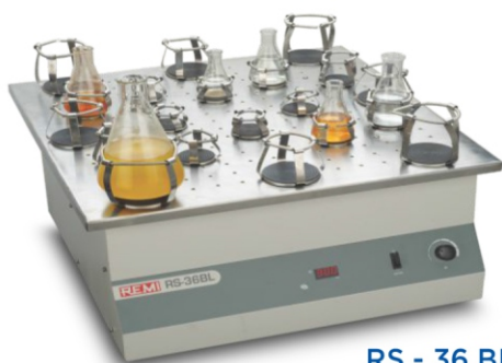
RS - 36 BL

These Shakers are ideal for mixing and development of cultures, chemicals, solvents, and assays etc. in Microbiological, Cell Culture & Life Science laboratories.