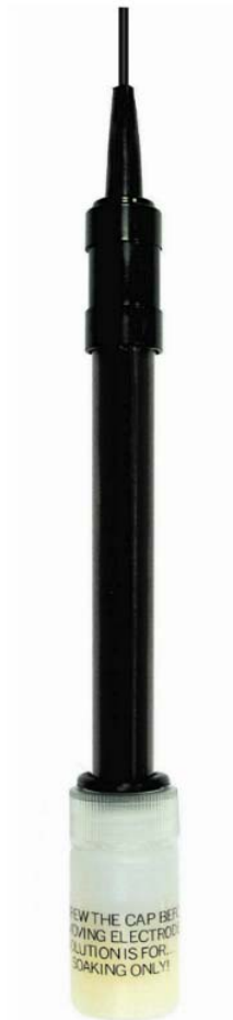
ORP Electrode ORP-14, optional