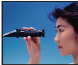
③Look through the eyepiece and measure the value.