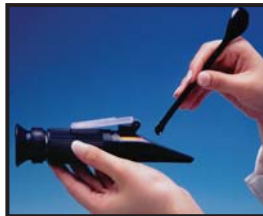
②Close the day-light plate gently.