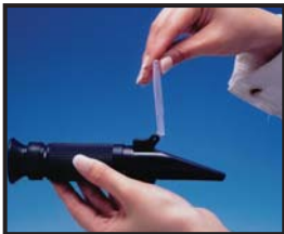
①Place a couple of drops of sample onto the prism.