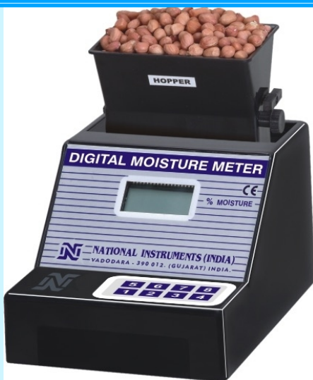
DMM - Regular Model